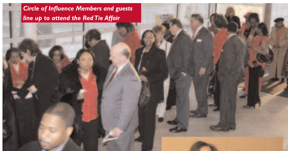
Circle of Influence Members and guests line up to attend the Red Tie Affair