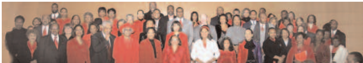
Meet the Circle of Influence – names of members and add'l pictures at www.daytonurbanleague.org